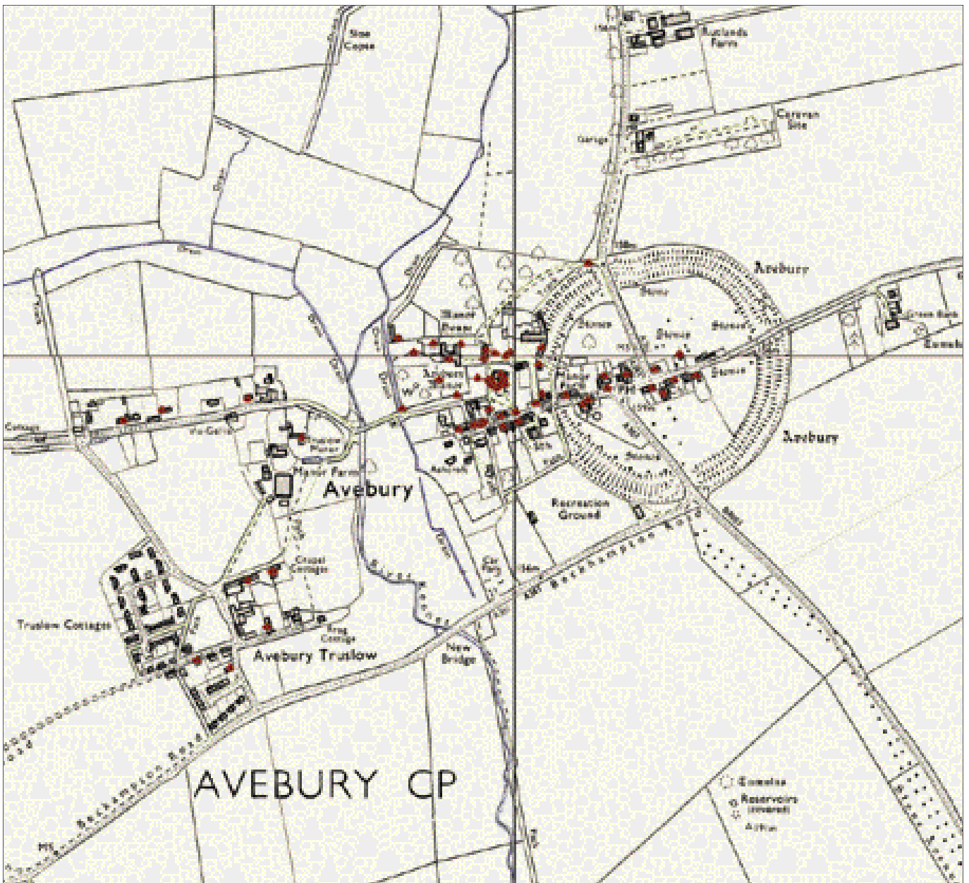
Figure 8: Avebury Village and Henge